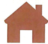
Water efficiency standards

Proposed water efficiency standards for new commercial construction include: